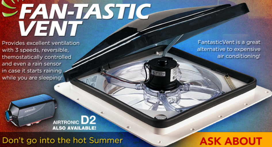
AIRTRONIC D2 ALSO AVAILABLE!

FantasticVent is a great alternative to expensive air conditioning!