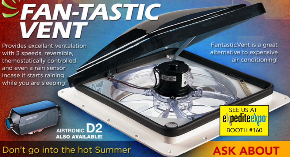
AIRTRONIC D2 ALSO AVAILABLE!

FantasticVent is a great alternative to expensive air conditioning!